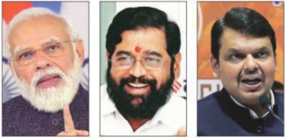
आहे. मोदी यांनी शिंदे यांचे कष्टाळू आणि गतिशील असे कौतुक केल्याने सत्ताधारी पक्षाबरोबरच विरोधकांच्या भुवया उंचाळल्या आहेत. शिंदे यांना नाझलाजाने स्वीकारावे लागणाऱ्या भाजप नेत्यांमध्ये मोदी यांच्या ट्वीटमुळे अस्वस्थता पसरणे स्वाभाविकच होते. शिवसेनेच्या ठाकरे गटाने मात्र शिंदे यांना लक्ष्य करण्याची संधी सोडली नाही. 'मोदी यांची ही भेट म्हणजे निरोप समारंभ होता', अशी

मुंबई: 'महाराष्ट्राचे गतिशील आणि कष्टाळू मुख्यमंत्री', असा उल्लेख पंतप्रधान नरेंद्र मोदी यांनी केल्याने राज्याच्या राजकीय वर्तुळात त्याचे पडसाद उमटले. यावरून शिंदे यांच्या पुत्राने उद्भव ठाकरे यांच्यावर बोचरी टीका केली, तर मोदींची भेट ही शिंदे यांच्या निरोपाची भेट होती, असा टोला ठाकरे गटाने लगावला.