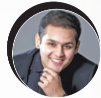
Baal Veer actor Dev Joshi

2001: American entrepreneur Dennis Anthony Tito becomes first space tourist to fund his own space trip. He spent 8 days in a visiting mission to the International Space Station